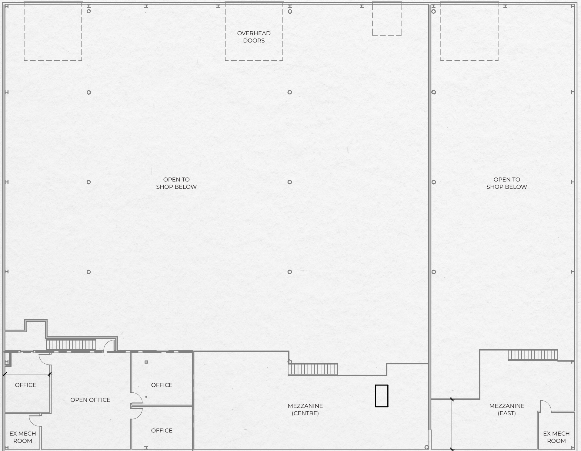
SECOND FLOOR AND MEZZANINE